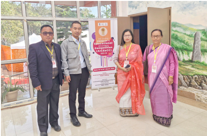
Four member team representing set, IIE at the AICEeCC 2023-24