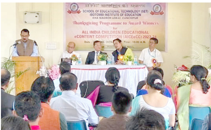
Thanks Giving Programme to Award Winners for AICEeCC 2023-24