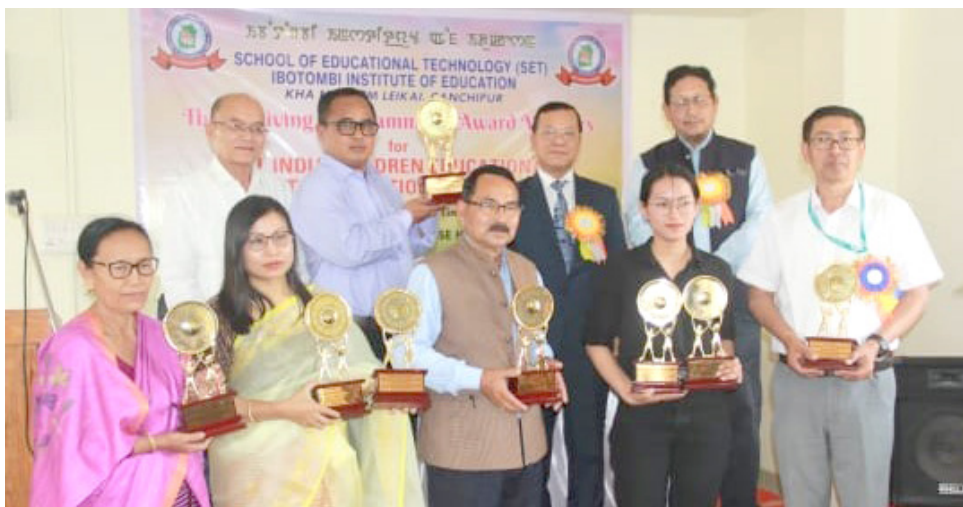
Award winners in the AICEeCC 2023-24 at the thanks giving function to award winners at the AICEeCC 2023-24

As part of digital transformation in the field of education and after the real life experience of pandemic in recent years the School of Educational Technology (SET), Ibotombi Institute of Education, Canchipur, was inaugurated and opened as a constituent body of the Institute of 11th November 2022. The SET is privately run by MIMA. It is expected to implement educational technology projects utilizing all kinds of modern media, methods and materials to provide educational content and process to all. Its main emphasis is on the production of Educational Television (ETV) programs for school going children, teachers and lifelong learning. The SET has developed its own audio recording studio at IIE Campus. The student teachers of the Institute who have a real and passion to write script and act in audio and video plays are encouraged through different platforms.